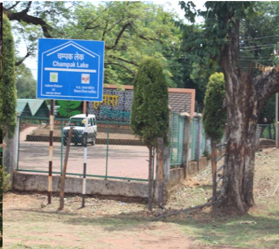
Champak Lake Parking Area