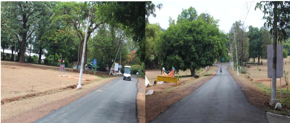
Road intersecting the site