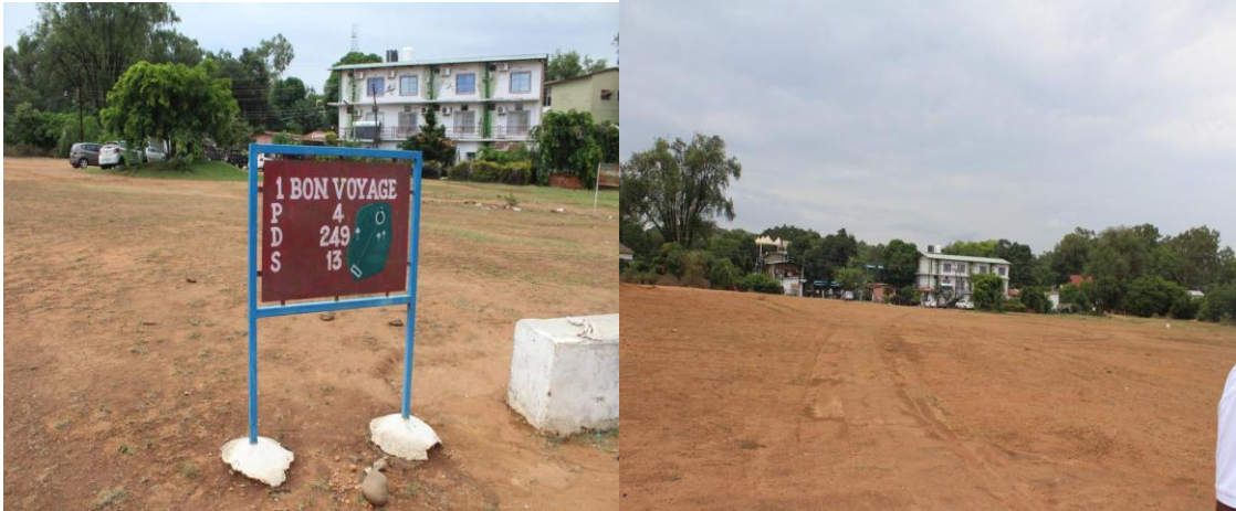
Private construction at one corner of the site