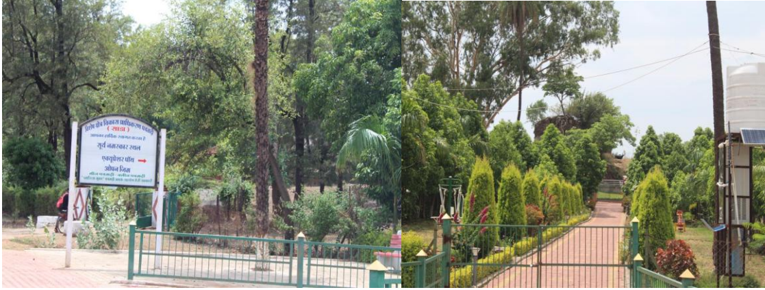
Small Surya Namaskar Facility at the Site ( approx 0.5 acres)