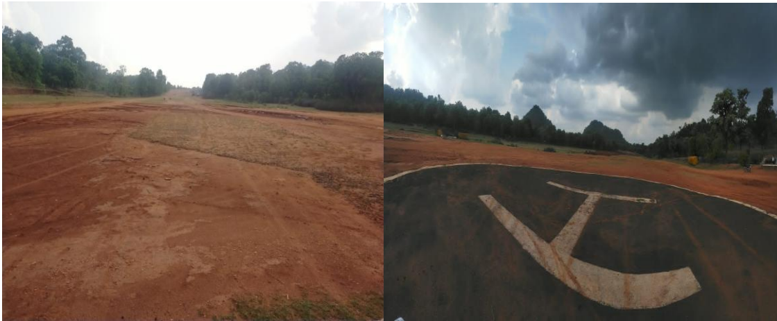
Existing Air Strip which is 2.5 KM from Golf course site